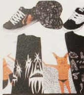
RECYCLABLE VS WING