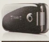
SONY ERICSSON Z810