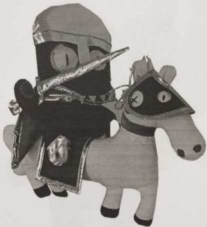
Special Edition / Kakuomagezō #12 / 48