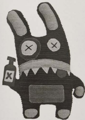
#1 Kakuomagezō #12 / Special Edition